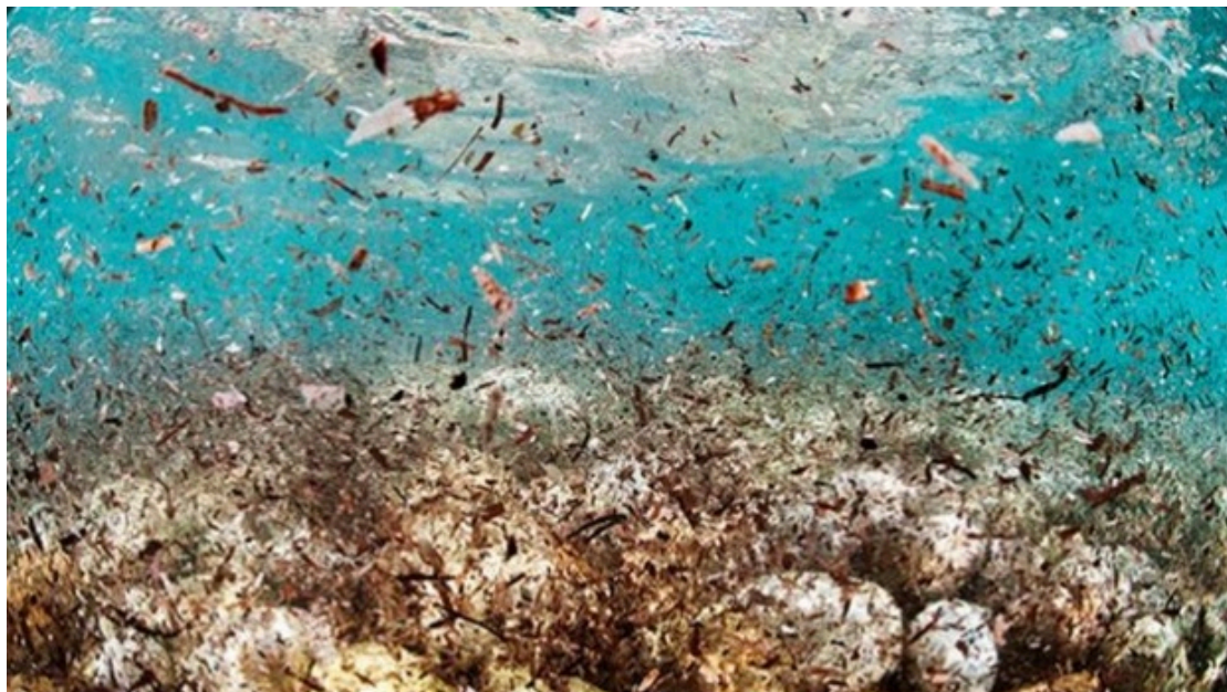
Microplastic particles constitute a significant part of the 'plastic soup' clogging oceans.