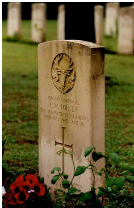
Photograph taken on a visit arranged by the British Legion

Kirkee, also known as Khadki, is a Military Cantonment adjoining the large university town of Poona on the Plateau above Bombay