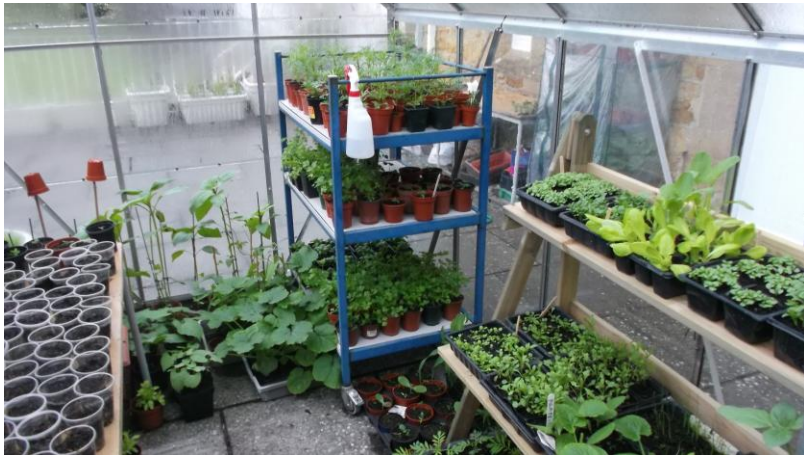
Our new green house!